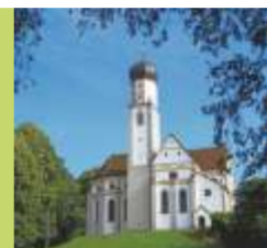
Pilgrimage church of St. Otilia