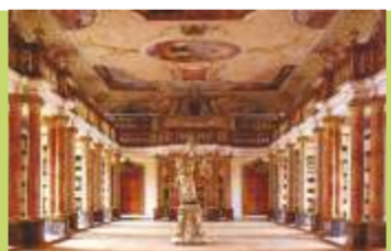
Ottobeuren Abbey library