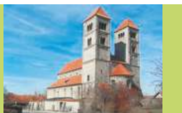
Romanesque basilica Altenstadt