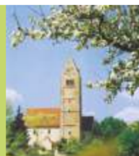
St. George's Church

Viewing by appointment only Georgibergstraße, 87656 Germaringen For information, phone (verger) 08344/1059 www.germaringen.de