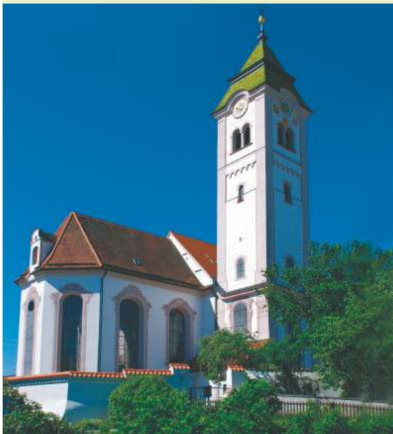
Parish Church, Stöttwang

Open daily Pfarrer-Klein-Straße, 87677 Stöttwang For information, phone 08345/329 www.stoetwang.de