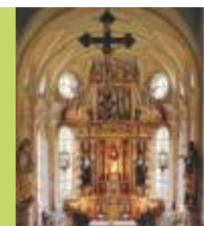
Chancel St. Otilia's Church