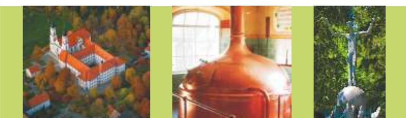
Swabian Education Centre

Take the B 16 in the direction of Bad Wörishofen, and after approx. 2 km take the Irsee exit at the roundabout.